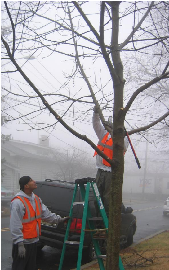
Prune young trees every 2-3 years for health & aesthetics.

NJ Tree Foundation 576 Leesville Rd. Jackson, NJ 08527 Fax: 732-608-8483