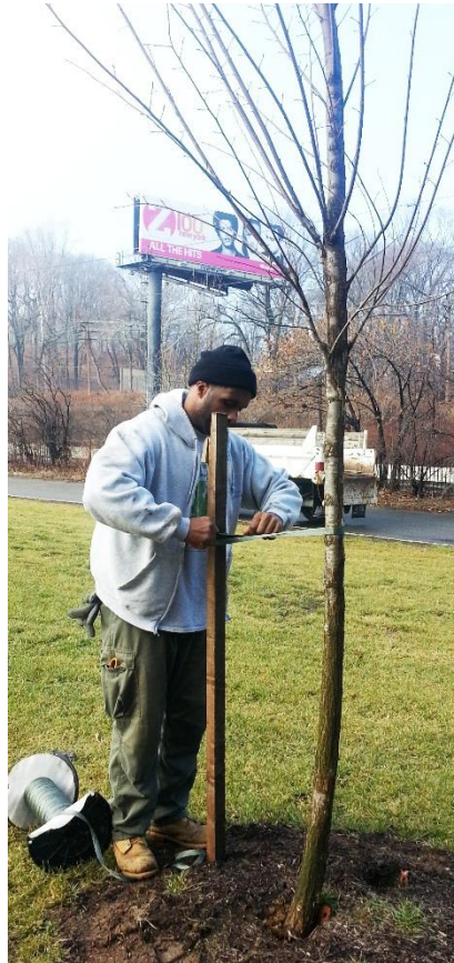
Do you have leaning trees? We will stake & Arbor Tie them.